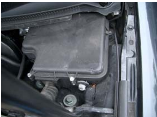
Fuse box (Audi A6)

The slot for the power supply relay is located in the fuse box.