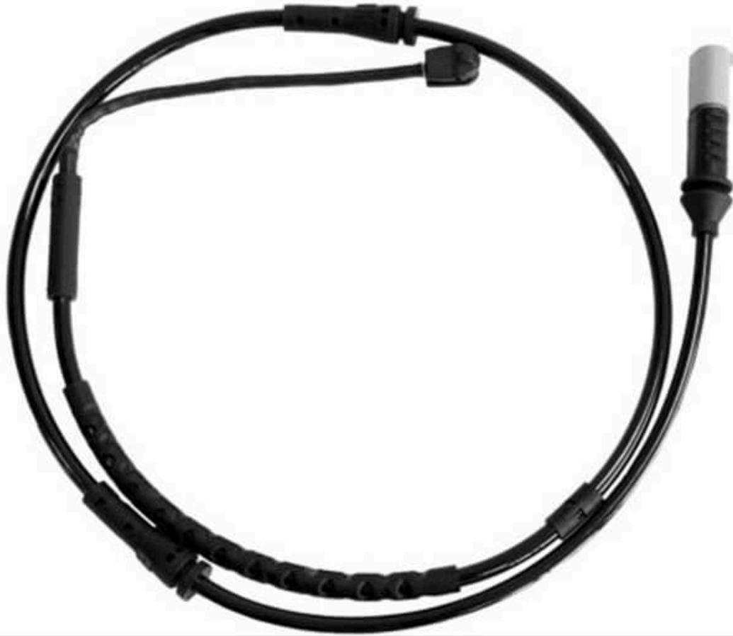
Brake pad wear indicator warning contacts