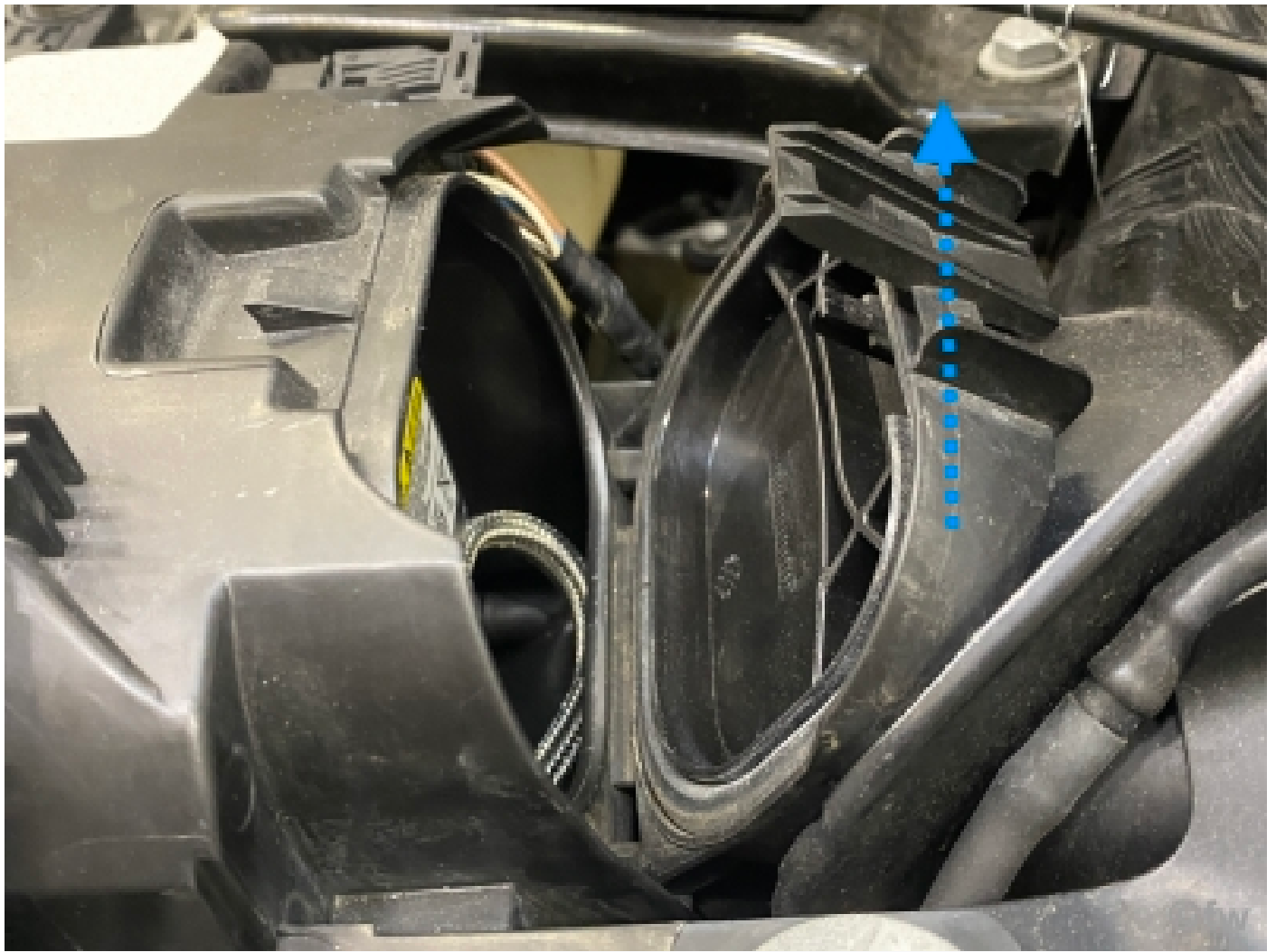
Side view of the Mini R57 lamp cover cap