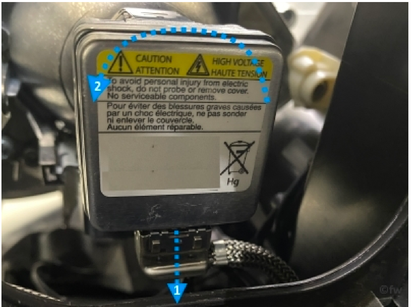
Plug connection on the Mini R57 light source