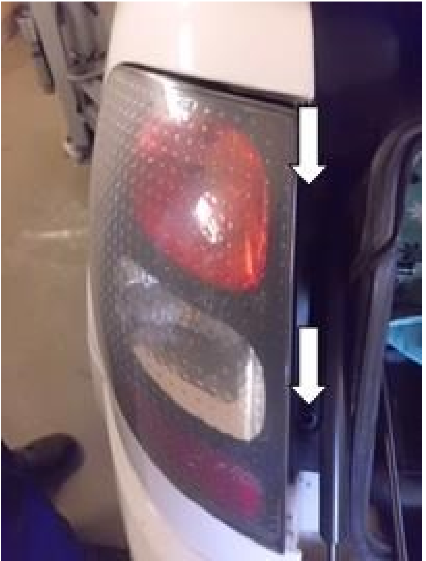
Figure 1 Figure 2