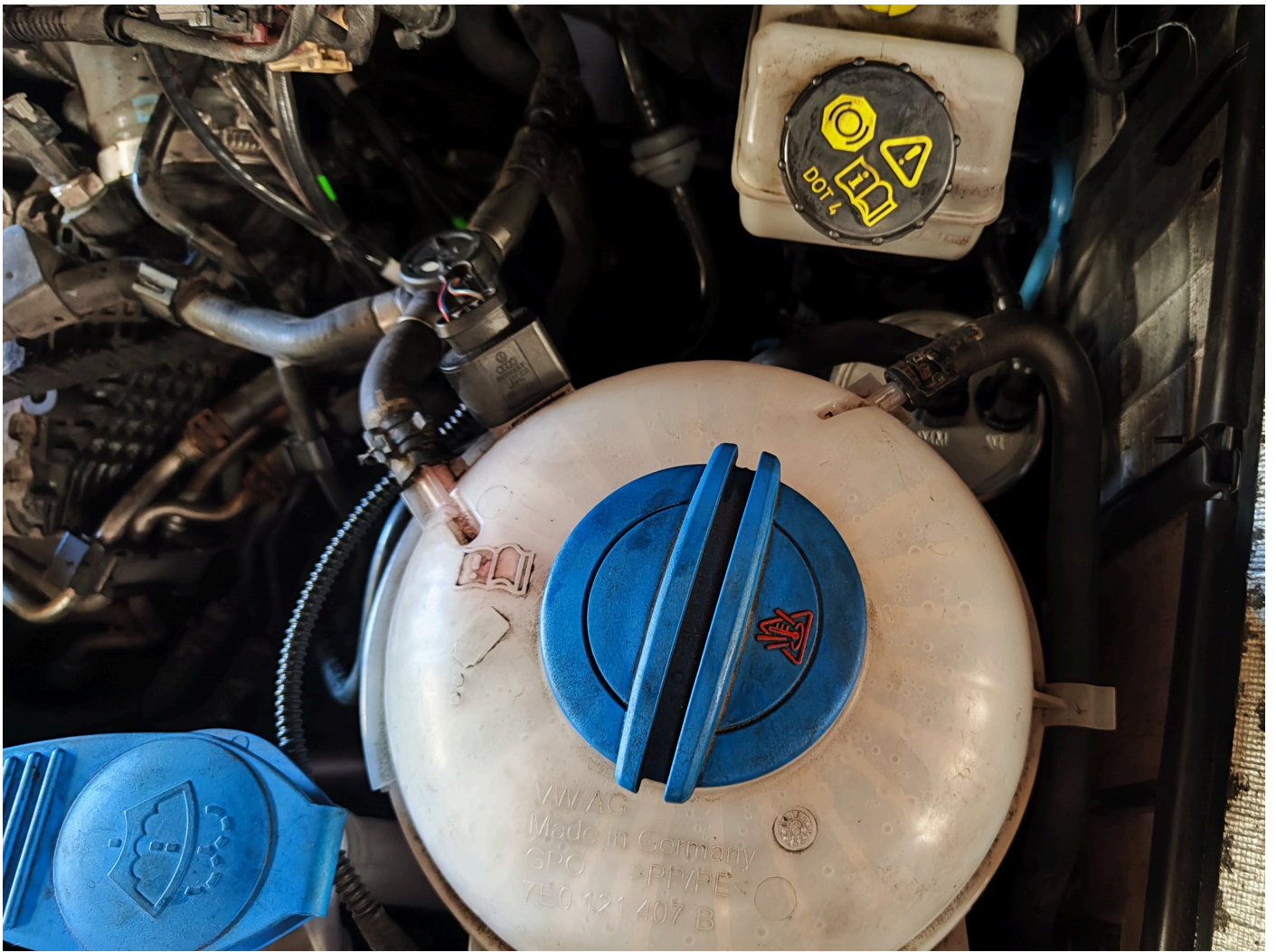
Expansion tank T6