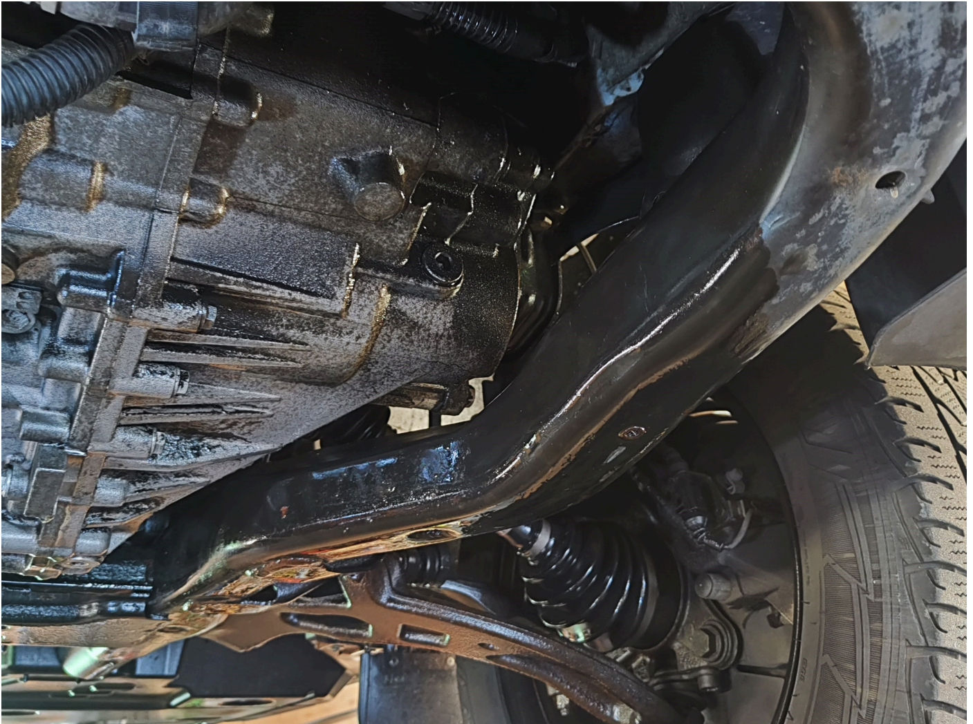
Fuel loss T6

Please always follow the repair instructions from the vehicle manufacturer when carrying out such work!