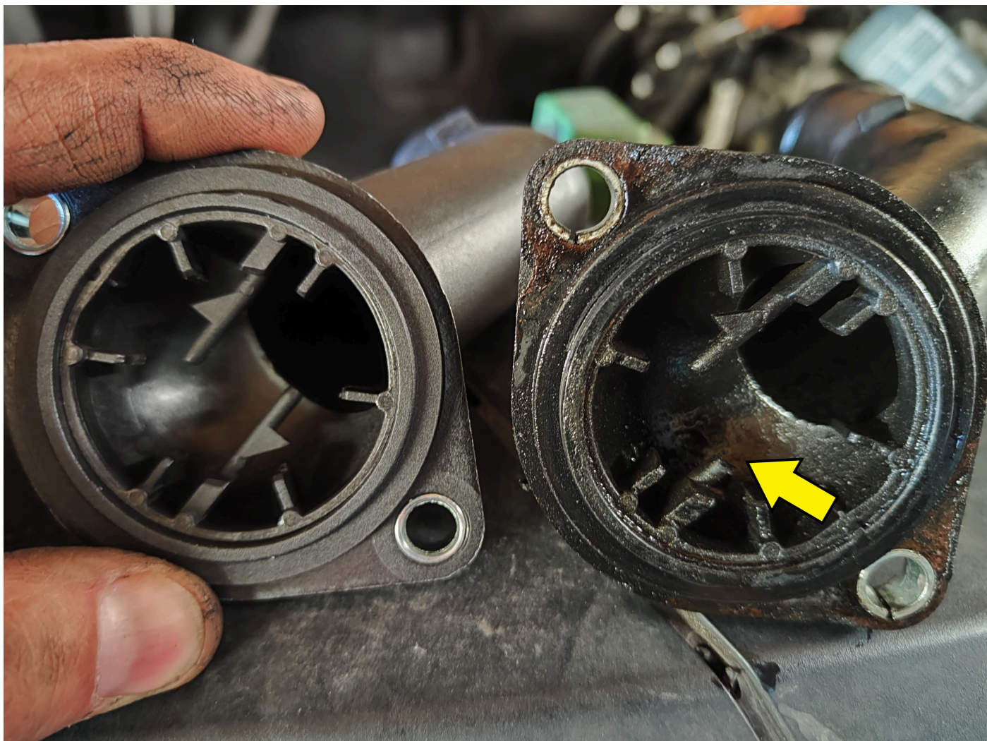
Plastic guide for T5 coolant flange