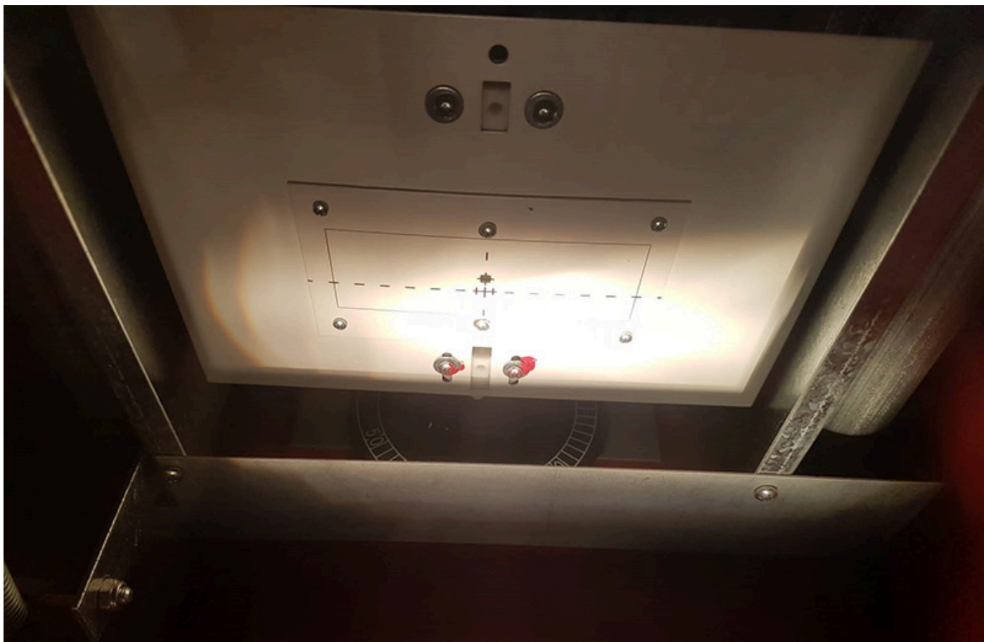
Figure 1: uncontrolled scattering of light