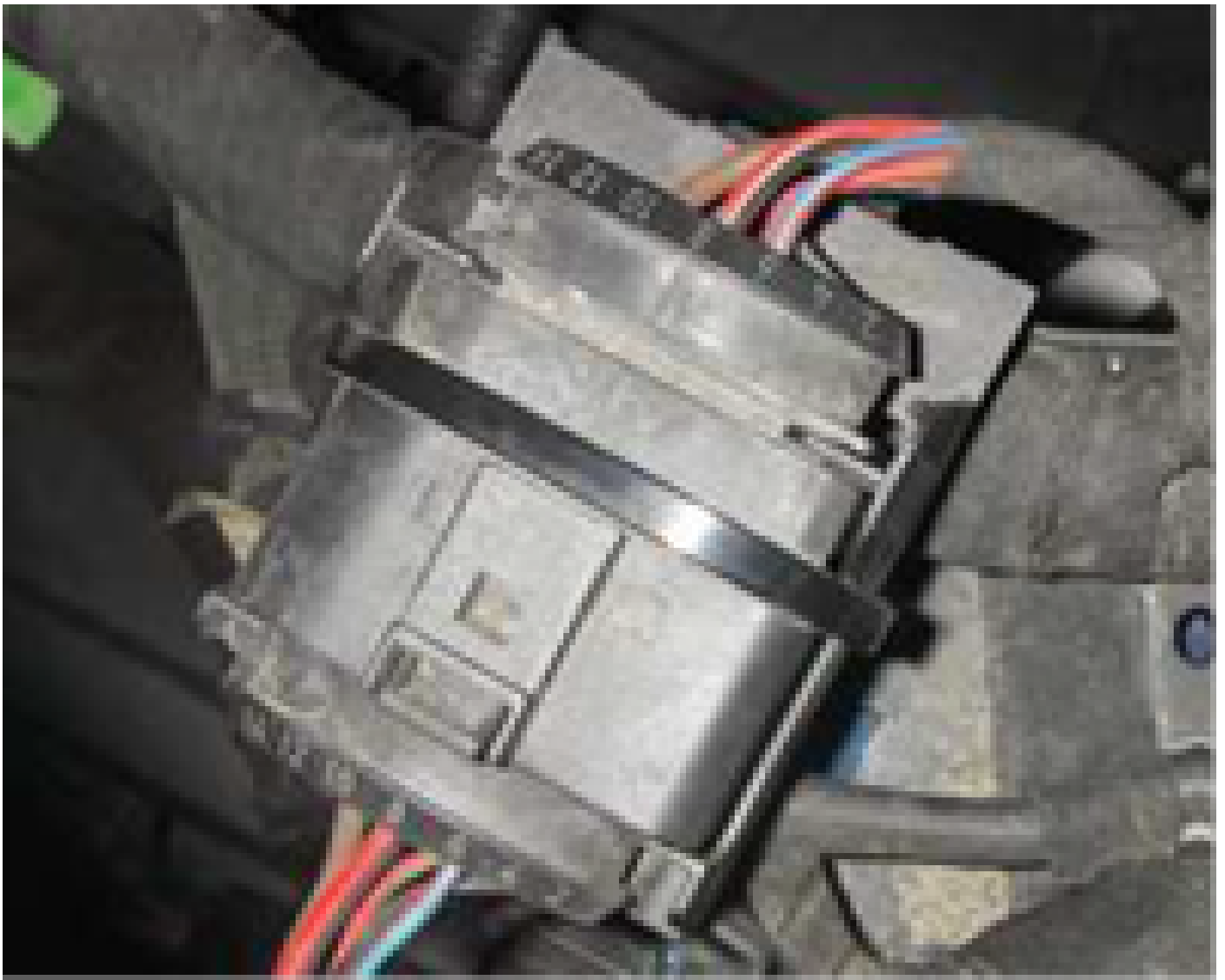
Figure 1.: 14-pin connector