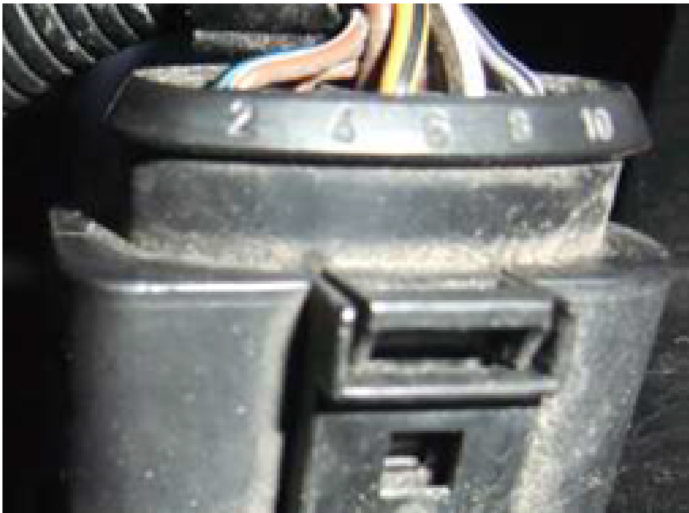
Figure 2.: 10-pin connector