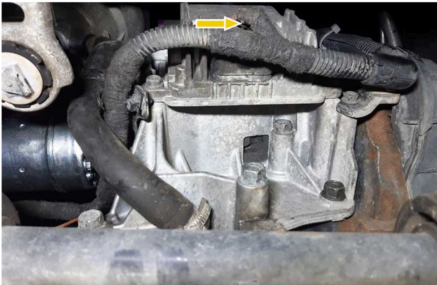
Starting from the underbody, steering control unit