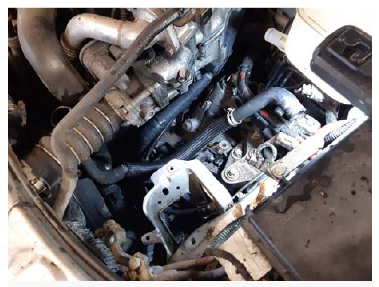
Figure 1: Removing the battery and battery bracket

The coolant temperature sensor has been installed to the left of the thermostat. Pay particular attention to the short coolant hose behind it. In some cases, it has been damaged, thus causing a leak that is hard to find.