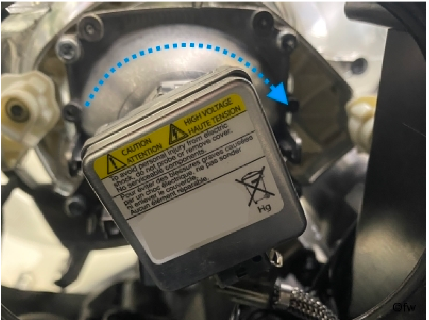
Rear view of the Mini R57 light source

Reprinting, distribution, reproduction, exploitation in any form whatsoever or disclosure of the contents of this document, even in part, is prohibited unless our express permission has been obtained in writing beforehand and the source is stated. The schematic illustrations, pictures and descriptions are provided for explanatory purposes and are only intended as a visual supplement to the document text, so they cannot be used as the basis for installation or assembly work. All rights reserved.